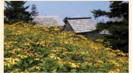
Summer flowers blooming outside LeConte Lodge Cabins

LeConte Lodge ... a very unique experience located deep in protected national lands.