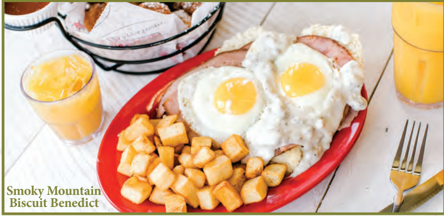
Smoky Mountain Biscuit Benedict