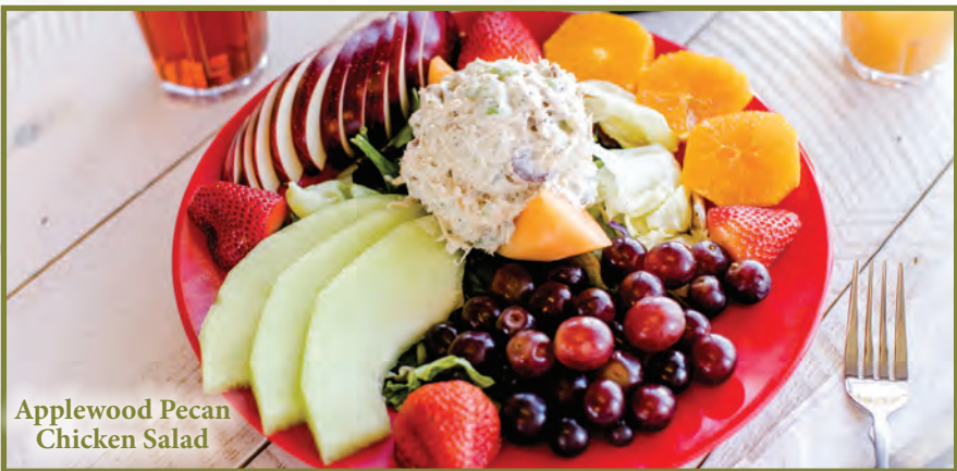
Applewood Pecan Chicken Salad

Buttermilk Ranch • Honey Mustard • Balsamic-Honey Vinaigrette • Chunky Bleu Cheese • Italian • Fat Free Ranch