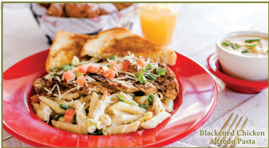
Blackened Chicken Alfredo Pasta

Served with Choice of Grandma's Vegetable Soup or Loaded Potato Soup.