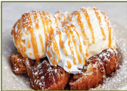
Caramel Apple Fritter Sundae