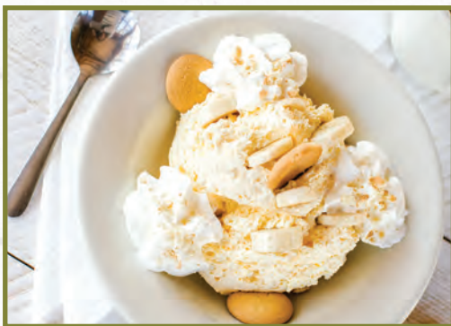
Polly's Banana Puddin'