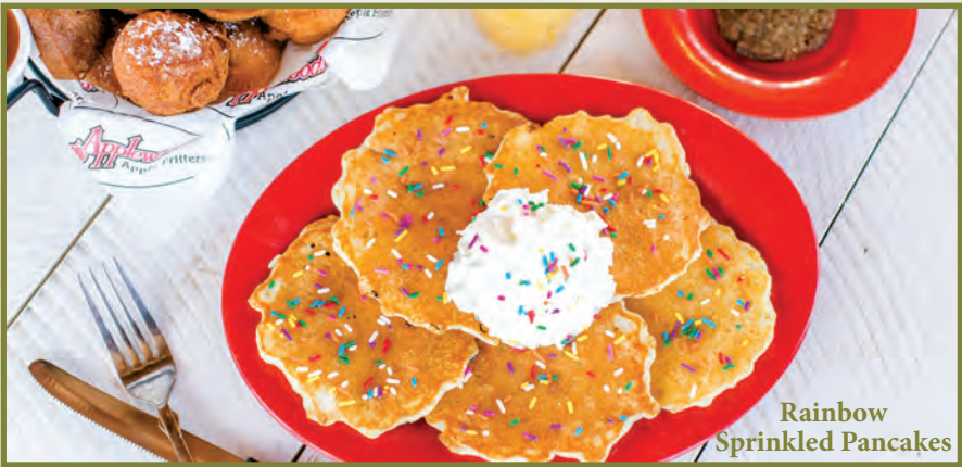
Rainbow Sprinkled Pancakes