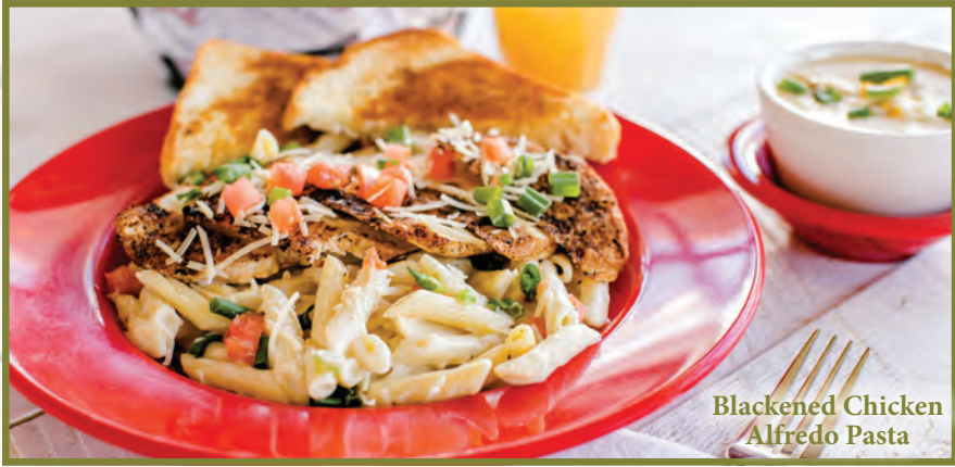
Blackened Chicken Alfredo Pasta

Served with Choice of Grandma's Vegetable Soup or Loaded Potato Soup (with exception of Soup & Skillet).