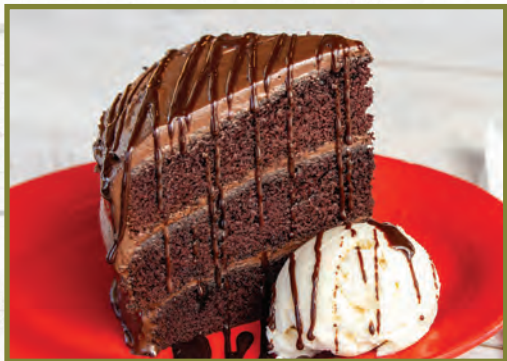
Double Chocolate Cake