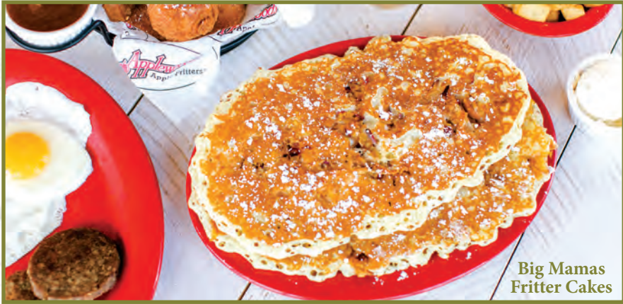
Big Mamas Fritter Cakes

*Two Eggs Cooked To Your Liking, Three Bacon Strips or Two Sausage Patties, Home Fried Potatoes and served with one of the following: