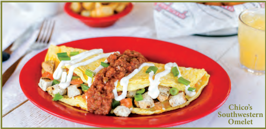
Chico's Southwestern Omelet

Farm Fresh Three Egg Omelets Prepared with Blended Shredded Cheeses and Served with Home Fried Potatoes