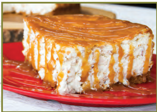
Salted Caramel Apple Cheesecake