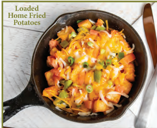
Loaded Home Fried Potatoes

Breakfast Potatoes, Scrambled Eggs, Ham, Bacon, Sausage, Shredded Cheeses, Mushrooms, Green Onions, Tomatoes and Green Peppers Layered in an Iron Skillet.