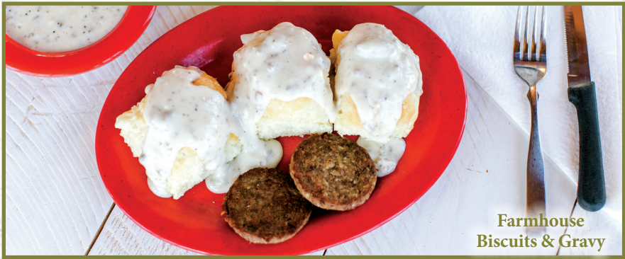
Farmhouse Biscuits & Gravy

If you enjoyed your experience at Applewood Farmhouse Grill please share on Google Reviews, Trip Advisor or Yelp.