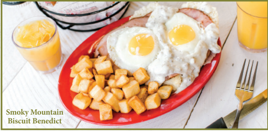
Smoky Mountain Biscuit Benedict