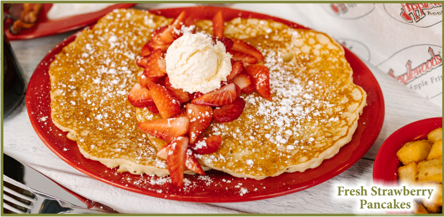
Fresh Strawberry Pancakes

*Two Eggs Cooked To Your Liking, Three Bacon Strips or Two Sausage Patties, Home Fried Potatoes and served with one of the following: