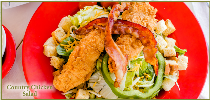
Country Chicken Salad