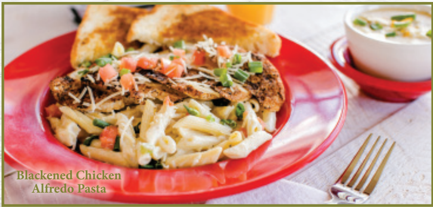
Blackened Chicken Alfredo Pasta

Served with Choice of Grandma's Vegetable Soup or Loaded Potato Soup.