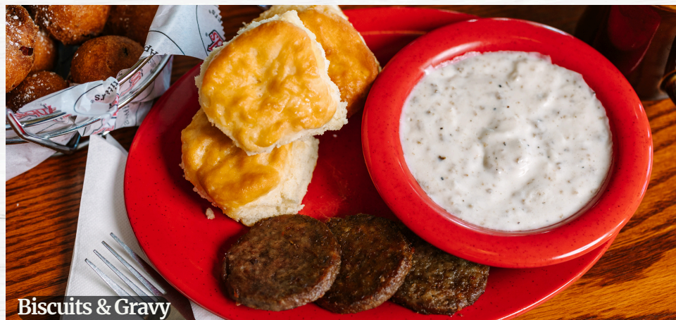
Biscuits & Gravy