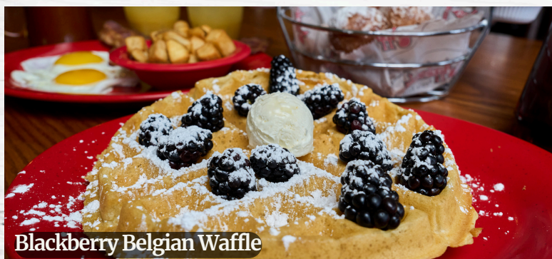
Blackberry Belgian Waffle

**Load Your Home Fried Potatoes with Tomatoes, Cheese, Green Peppers, and Onions for only +1.99