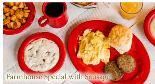
Farmhouse Special with Sausage