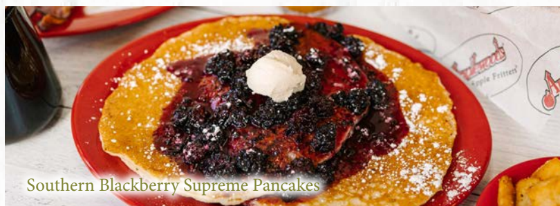
Southern Blackberry Supreme Pancakes

*Load your potatoes Farmhouse Style (Tomatoes, Cheese, Green Peppers & Onions) for $1.99