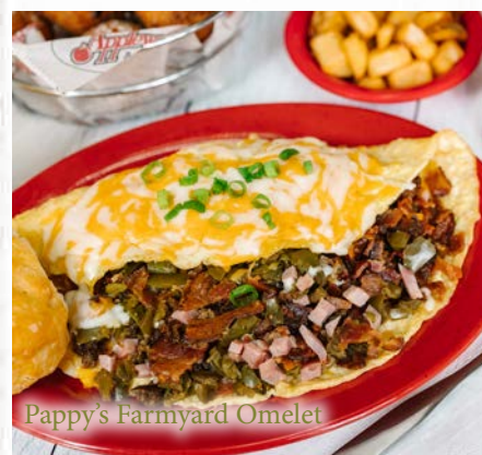
Pappy's Farmyard Omelet

*Load your potatoes Farmhouse Style (Tomatoes, Cheese, Green Peppers & Onions) for $1.99