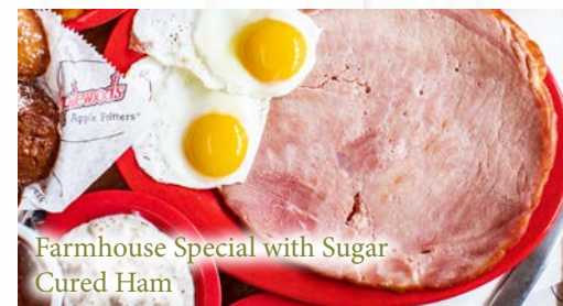
Farmhouse Special with Sugar Cured Ham