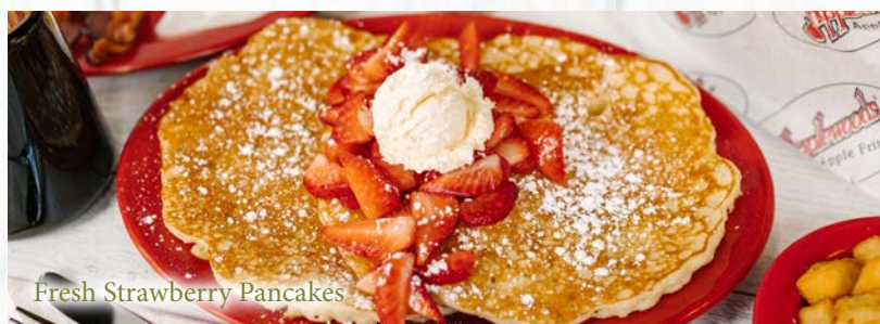
Fresh Strawberry Pancakes