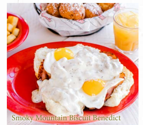
Smoky Mountain Biscuit Benedict

*Load your potatoes Farmhouse Style (Tomatoes, Cheese, Green Peppers & Onions) for $1.99