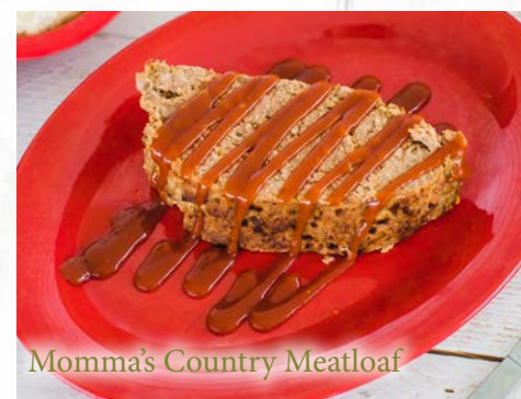
Momma's Country Meatloaf