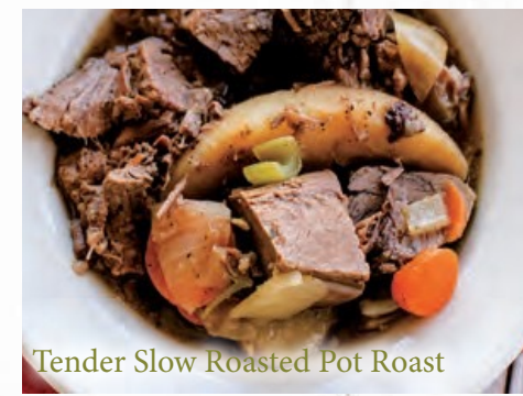
Tender Slow Roasted Pot Roast