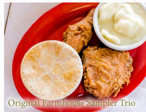
Original Farmhouse Sampler Trio