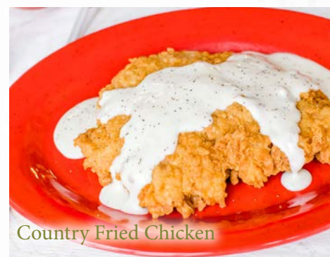
Country Fried Chicken