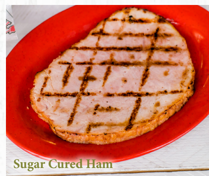
Sugar Cured Ham