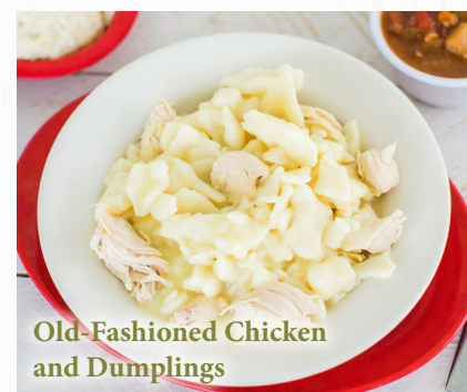
Old-Fashioned Chicken and Dumplings