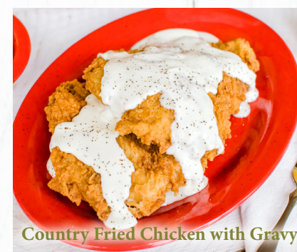
Country Fried Chicken with Gravy

Sharing is available with an additional plate charge of 7.99. Ask your server for details. An 18% Gratuity is included for parties of 8 or more.