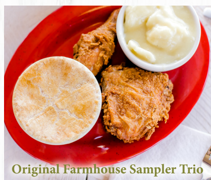
Original Farmhouse Sampler Trio